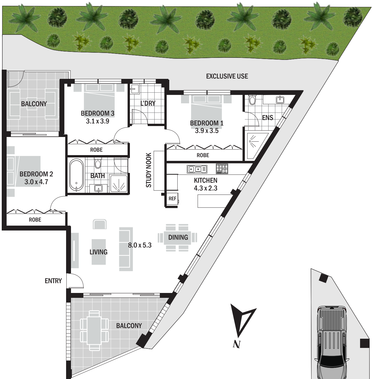
Apartment Floor Plan Level 2