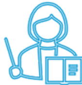
Lalor Gardens Primary School