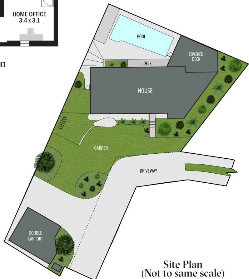
Site Plan (Not to same scale)