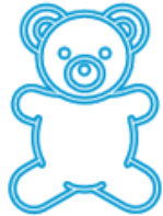
Thomastown Child Care Centre