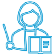
Thomastown West Primary School