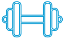
Thomastown Recreation & Aquatic Centre