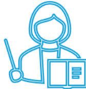
St Mary of the Cross Catholic Primary School