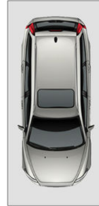
SECURE BASEMENT PARKING 1 2.4 x 5.2