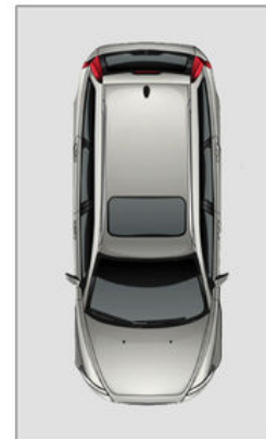
SECURE BASEMENT PARKING 2 3.1 x 5.2