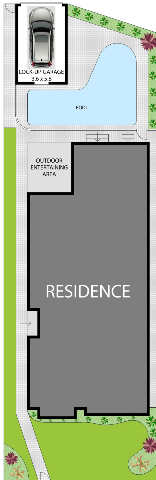
General Site Plan (Not to Same Scale)