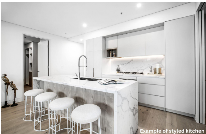
Example of styled kitchen