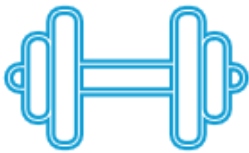
Thomastown Recreation & Aquatic Centre