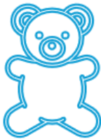
Guardian South Morang Childcare and Education