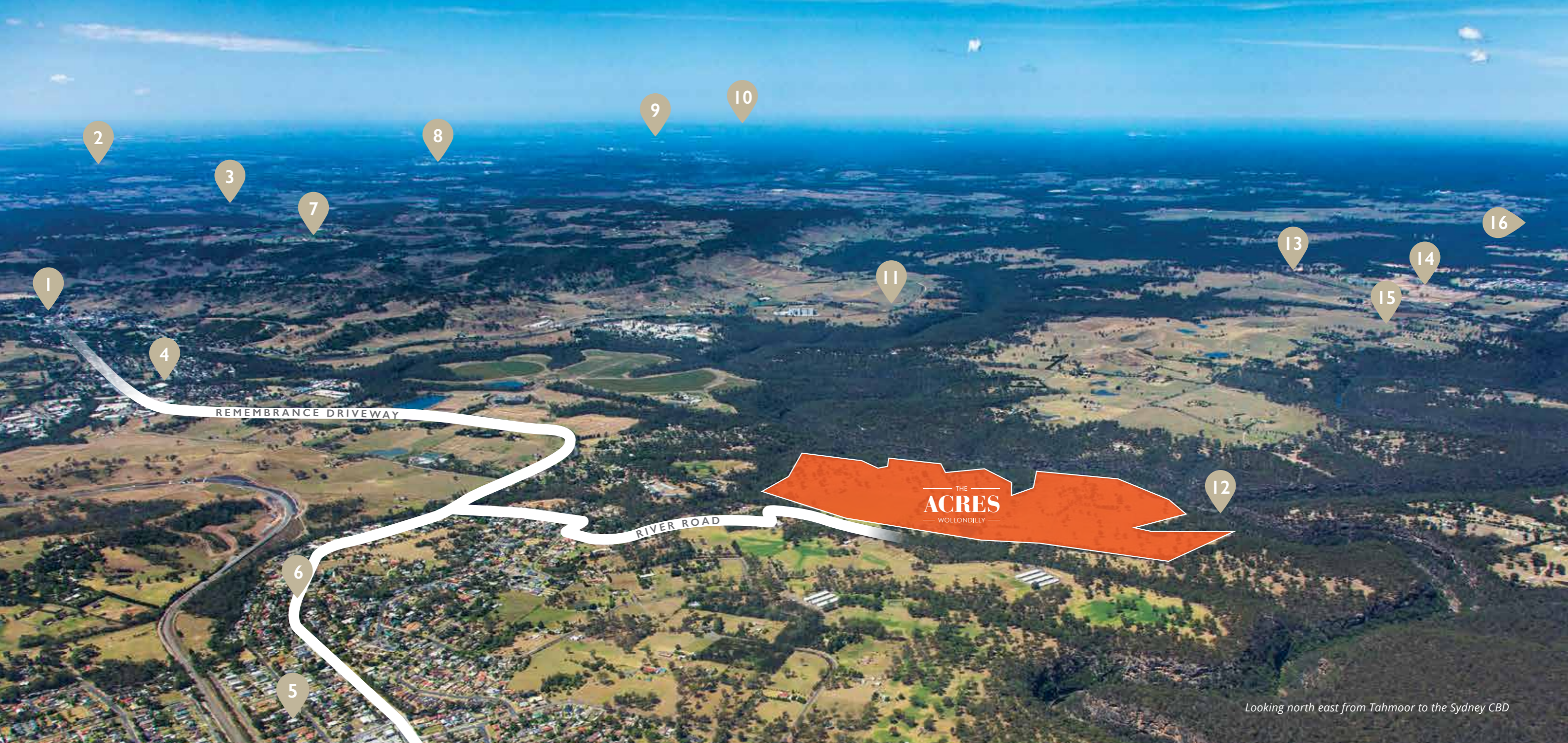
Looking north east from Tahmoor to the Sydney CBD