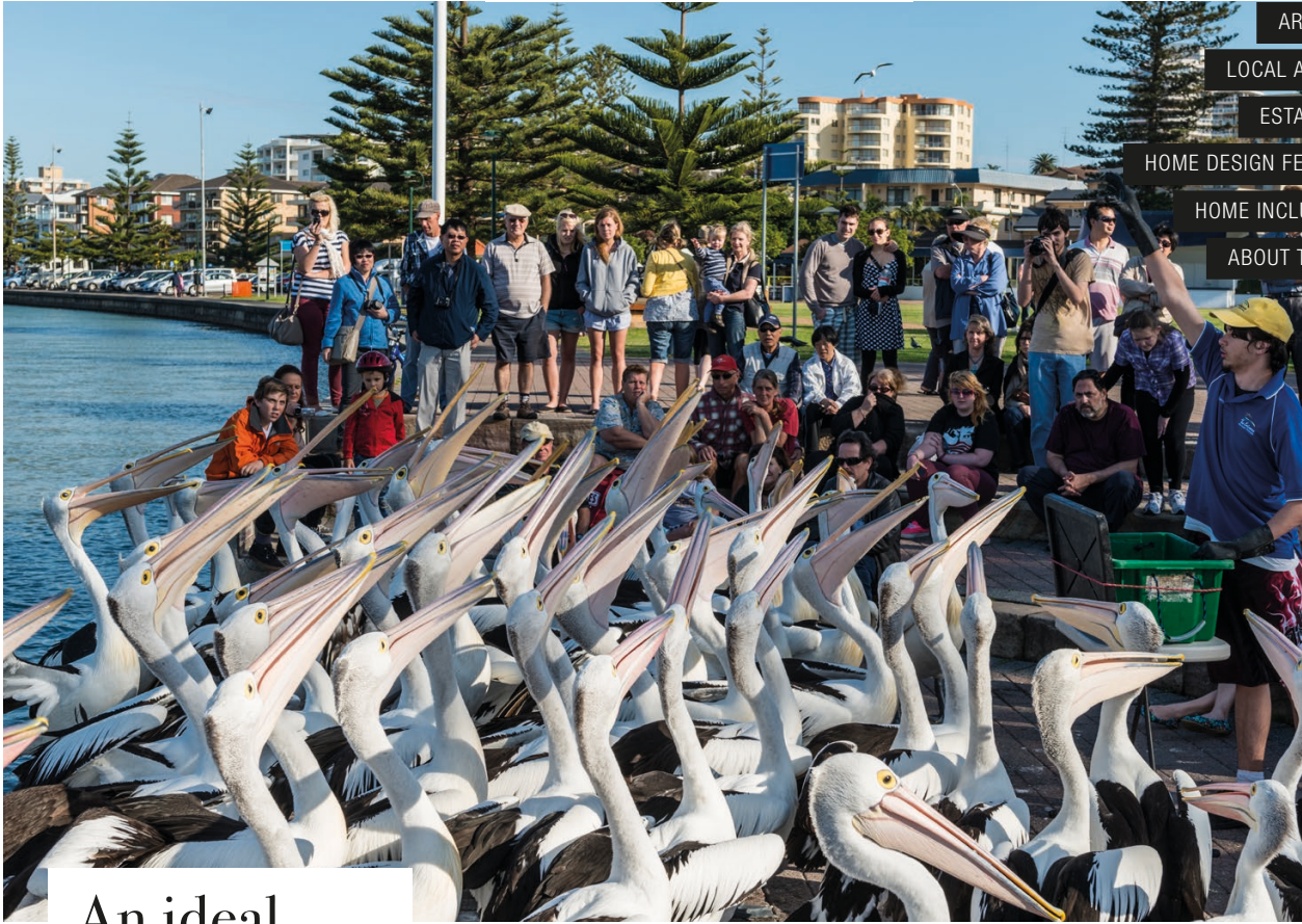
PELICAN FEEDING AT THE ENTRANCE

An ideal investment in a thriving location