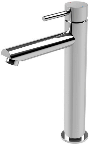
Chrome Round Vessel Basin Mixer