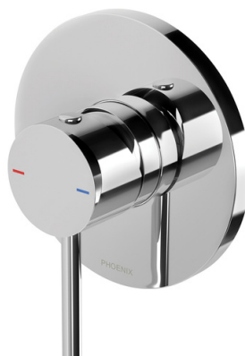
Chrome Round Shower Mixer