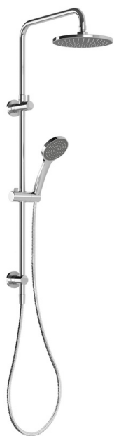
Chrome Round Twin Shower Rail