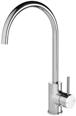
Chrome Round Sink Mixer