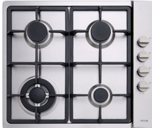
Euro 600mm Gas Cooktop