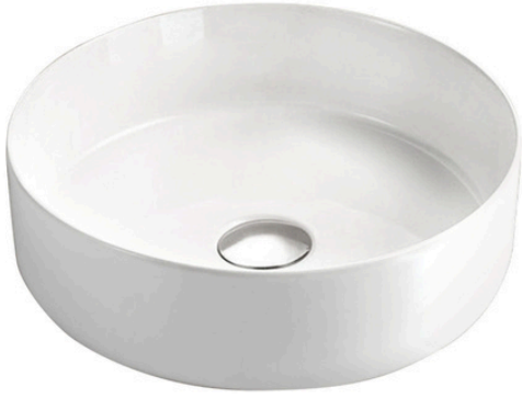
Round Above Counter Basin