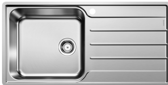
Stainless Steel Single Overmount Sink