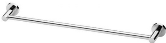
Chrome Round Towel Rail