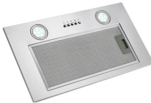
Euro 600mm Undermount Rangehood