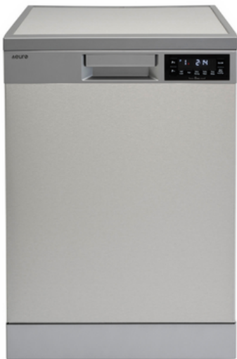
Euro 600mm Freestanding Dishwasher