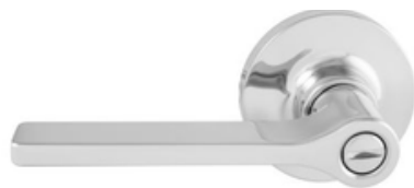
Gainsborough Internal Passage & Privacy Leverset (Bright Chrome)