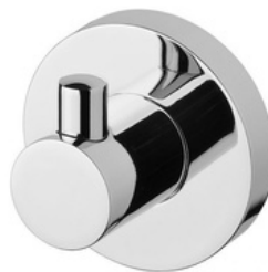
Chrome Round Robe Hook