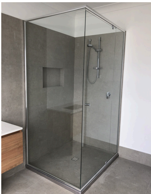
Satin Chrome Semi-frameless Shower Screen