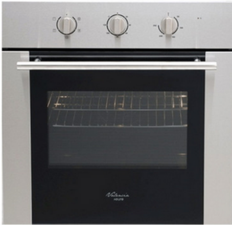
Euro 600mm Underbench Oven