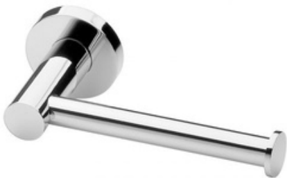
Chrome Round Toilet Roll Holder