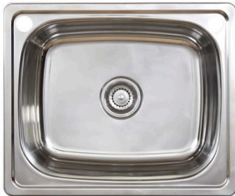
45L Stainless Steel Trough