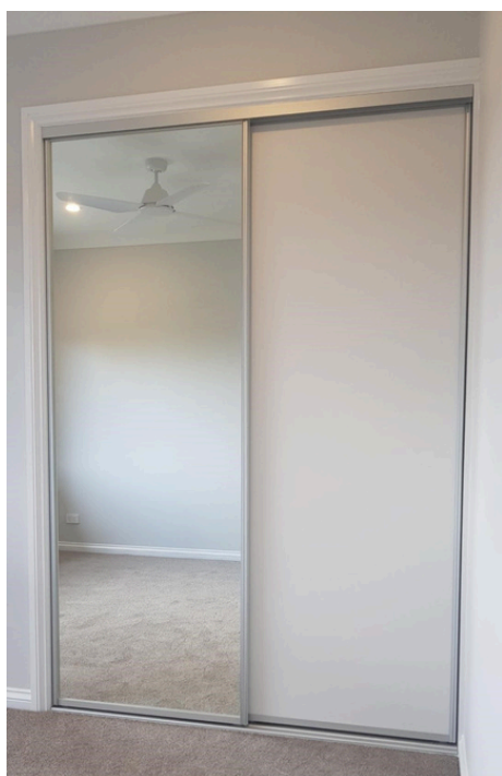
Full Height Mirror/Vinyl Sliding Robes