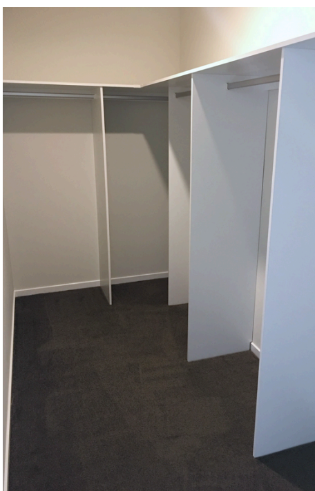
2000mm High Shelf & Hanging Rail