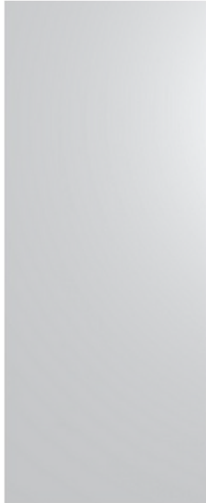
2340mm Humes Redicote Internal Doors