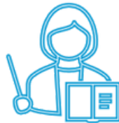
Lalor Gardens Primary School