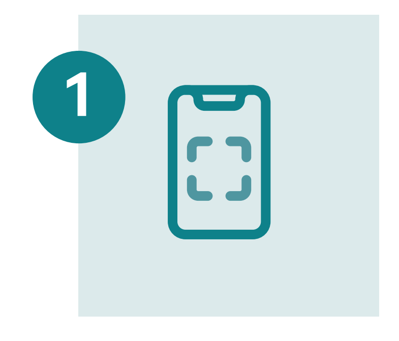
Use your phone to scan the code