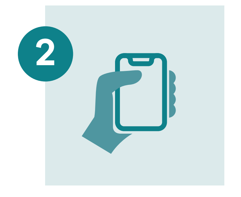
Enter your first name and phone number