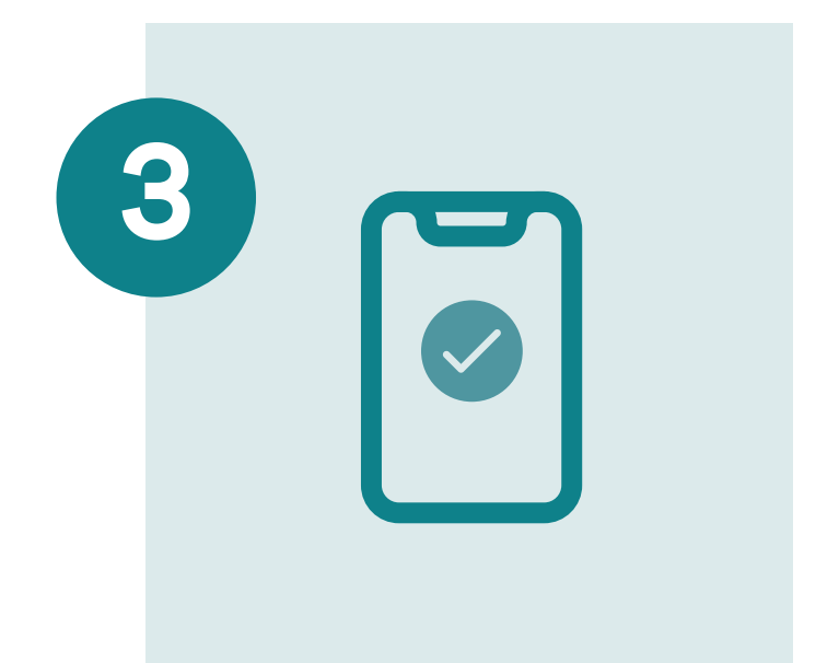
Look for the tick You're now checked-in