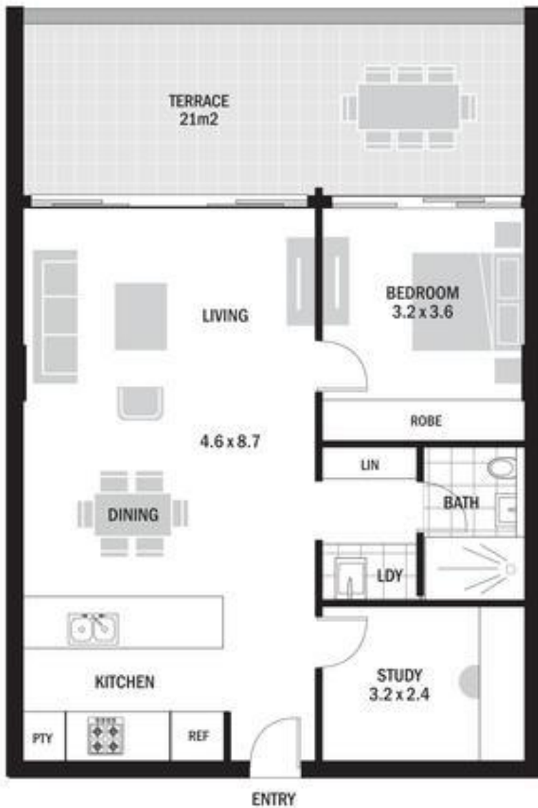
Apartment Floor Plan