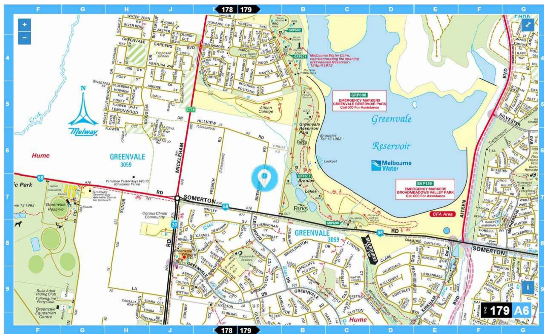
LOCALITY PLAN NOT TO SCALE