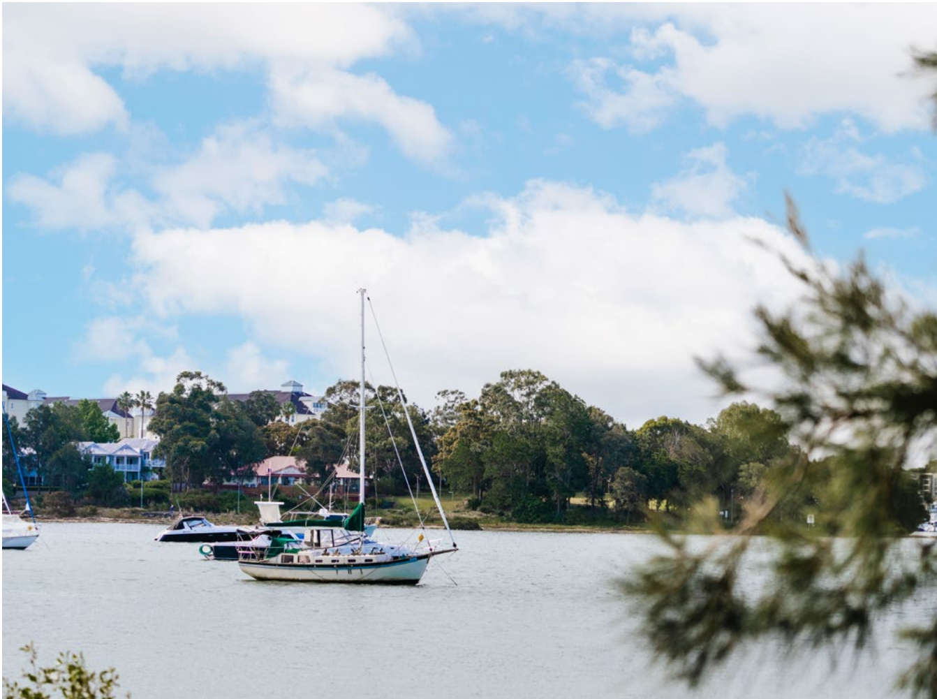
BAYVIEW PARK, CANADA BAY

With Burwood Park just a stone's throw away, and Canada Bay a short drive, you're never far away from the tranquility and beauty that only nature inspires.