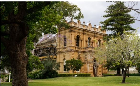
SANTA SABINA COLLEGE