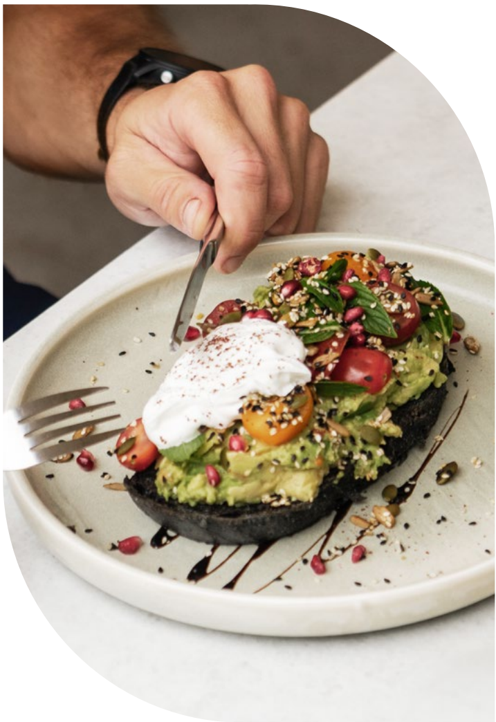
THE PICNIC BURWOOD

Whether you're a lover of active leisure time, outdoor yoga, meditative tai chi moves or you simply revel in the opportunity to take long strolls on boardwalks surrounded by nature, prepare to be spoilt for choice.