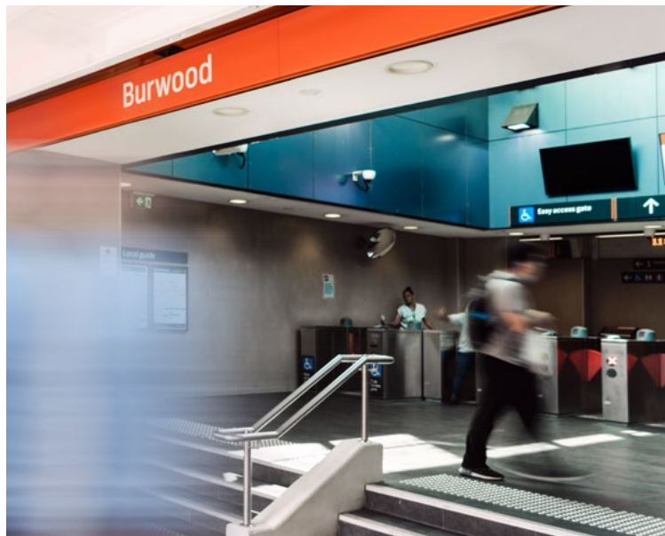
BURWOOD TRAIN STATION