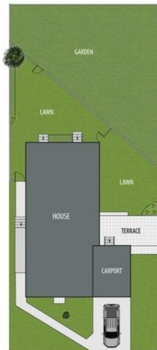
Site Plan (Not to same scale)