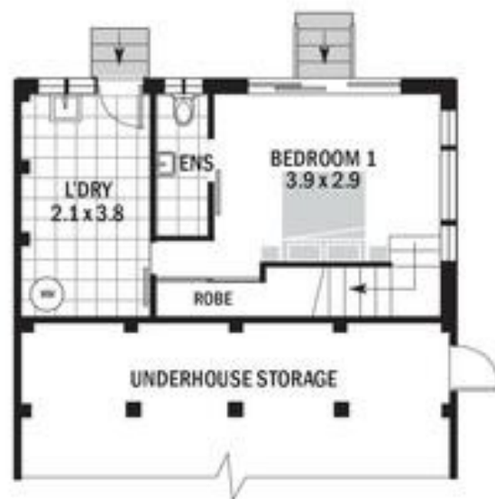
Lower Ground Floor Plan