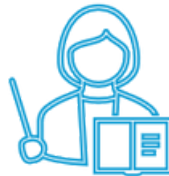
Lalor Gardens Primary School