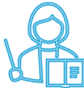
Thomastown Primary School