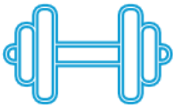
Thomastown Recreation & Aquatic Centre